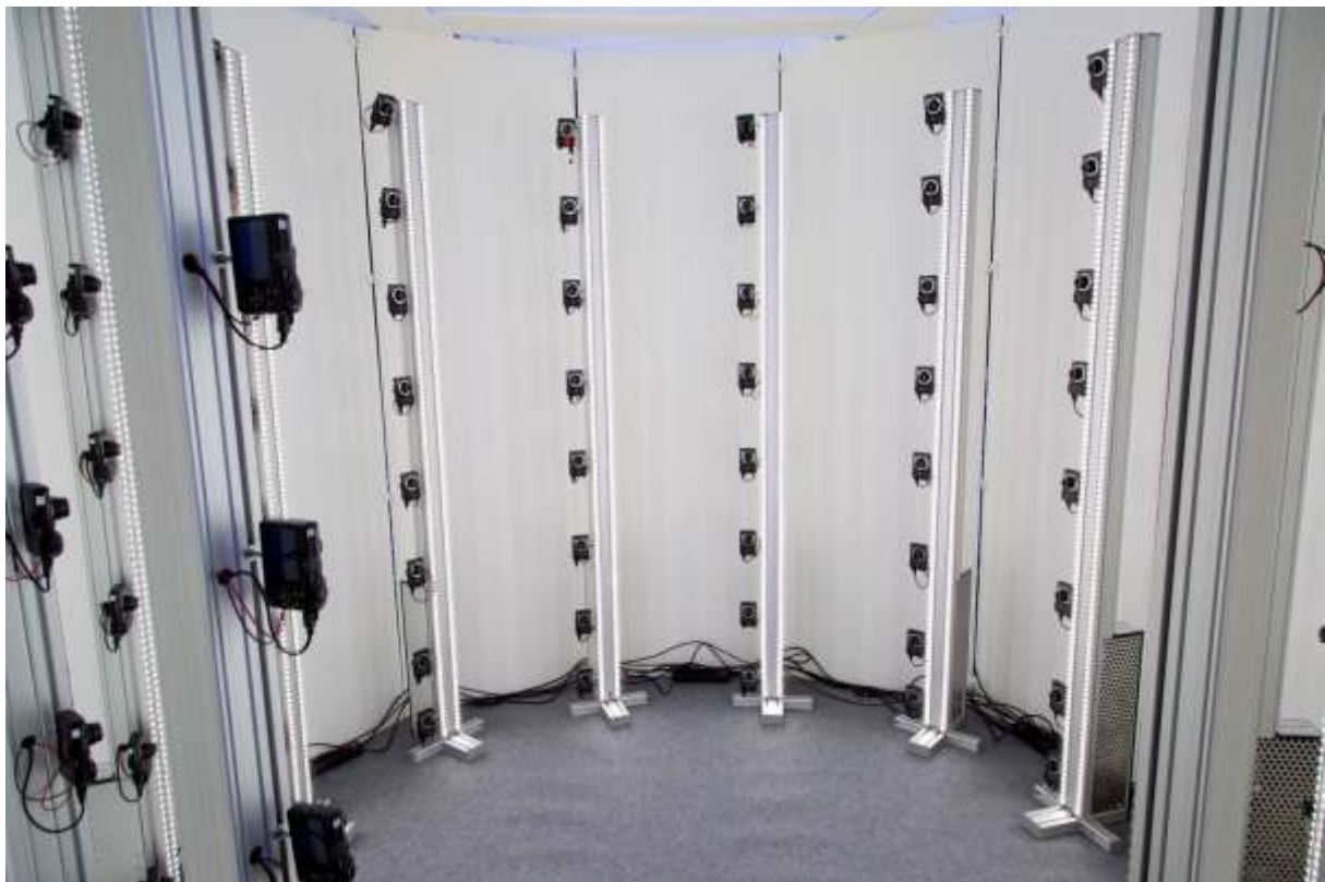
Fig. 1. Photogrammetric 3D scanner consisting of 96 Canon Powershot A1400 cameras

The cameras were running the Canon Hack Development Kit [18] (CHDK), an open-source alternate firmware allowing each camera's parameters and tasks to be controlled by a LUA script. In addition, the USB extension chdp-ptp [19] was used to remotely control the cameras from a single computer, trigger synchronized shoot and automatically download the pictures to the computer. This allowed the scanner to be controlled by a simple user interface. The synchronization mechanism was software only which resulted in a maximum sync error of about 100 ms. This can be considered as sufficient for scanning people standing in a specific position. Better synchronization could have been achieved by using a more complicated hardware sync mechanism [20] but this solution was not implemented in our application. Users were asked to stand in an A pose (arms inclined at roughly 45°), which facilitated the post processing of the 3D scan at a later stage of the pipeline (see template fitting below).