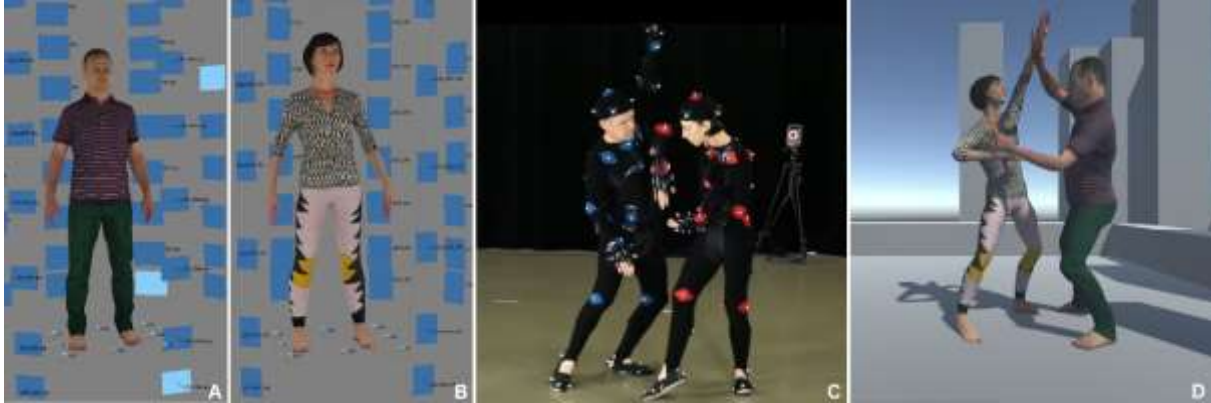
Fig. 4. A) & B) Post-processed 3D scan, B) Motion capture, C) View from the 3D game engine.

art motion capture technique (Fig. 4B). The motion capture data was then applied to the two avatars created from the 3D scans. A simple 3D environment was then created in which the dancing avatars were integrated (Fig. 4C). As in scenario 1, users could choose to be their own avatar or a generic one. They were then able to freely walk around the virtual dancers and at the same time see their own avatar and the other users. This scenario demonstrated the use of 3D body scan both for the user representation and for the content creation.